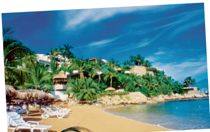
Above: Acapulco. Left: Michelle Pfeiffer in The Fabulous Baker Boys . Below: Marie Antoinette, Maxim's in Paris and cucumber sandwiches