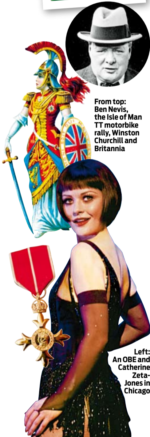
From top: Ben Nevis, the Isle of Man TT motorbike rally, Winston Churchill and Britannia