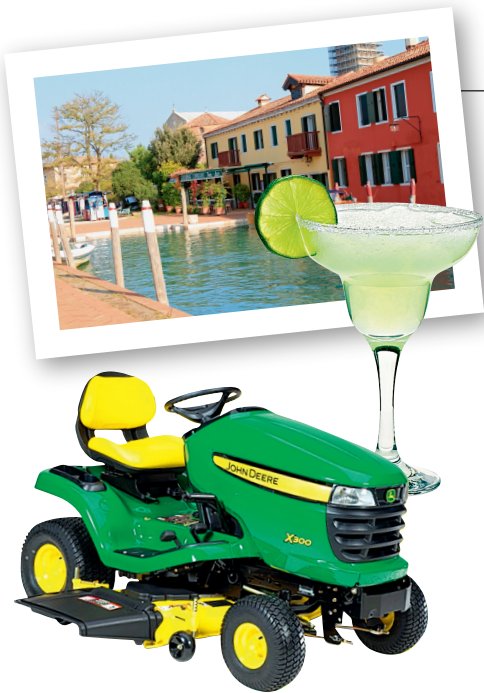
From top: Torcello near Venice, a margarita and a tractor mower. Below: Keith Floyd and a scone with clotted cream