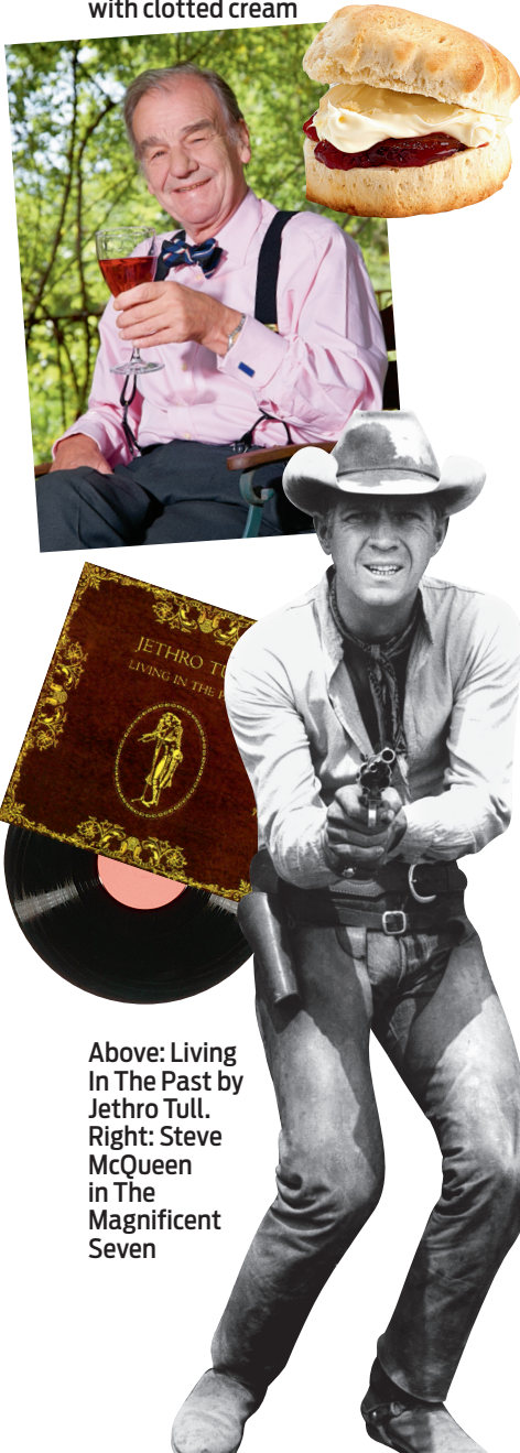
Above: Living In The Past by Jethro Tull. Right: Steve McQueen in The Magnificent Seven

The prized possession you value above all others... Denver, my black Labrador. He goes everywhere with me.