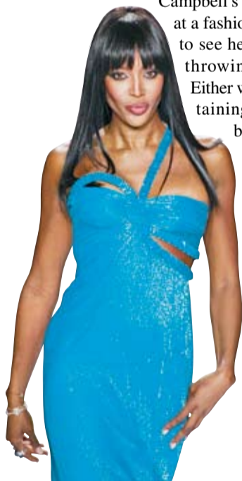
Left: Naomi Campbell. Above right: David Hockney's paintings done on an iPad. Far right: Monsoon Wedding

The priority activity if you were the Invisible Man for a day... I'd hang out in Naomi Campbell's dressing room at a fashion show, either to see her changing or throwing a tantrum. Either would be entertaining, both would be perfect!