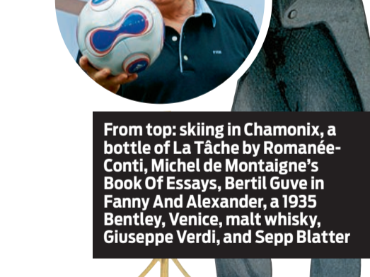
From top: skiing in Chamonix, a bottle of La Tâche by Romanée-Conti, Michel de Montaigne's Book Of Essays, Bertil Guve in Fanny And Alexander, a 1935 Bentley, Venice, malt whisky, Giuseppe Verdi, and Sepp Blatter

The prized possession you value above all others... My 1935 Bentley. It is a two-tone 3.5 litre standard saloon in green and cream. I have had it a few years and it goes beautifully. It's docile but fast enough to keep up with traffic.