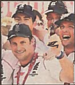
BIG DRAW: Ashes on tour

WITH the football World Cup over, sports fans can turn their attention to other major sporting events both in the UK and around the world.