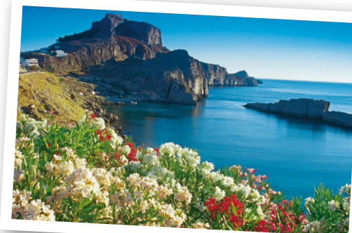
Left: Coco Chanel. Above: wild mushrooms and blackberries. Far right: A bay at Lindos on the Greek island of Rhodes