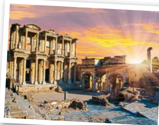
Right: The Odd Couple. Above right: wine gums. Far right: Ephesus in Turkey