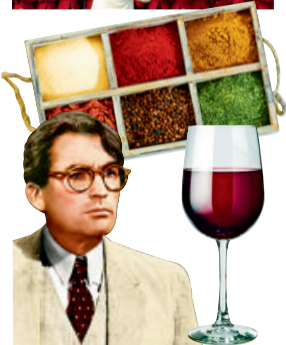
From top: Greece, Jesus, dolphins, a male-voice choir, curry spices, a glass of red wine and Gregory Peck in To Kill A Mockingbird

The prized possession you value above all others... There are a lot of things I like but nothing I couldn't live without.