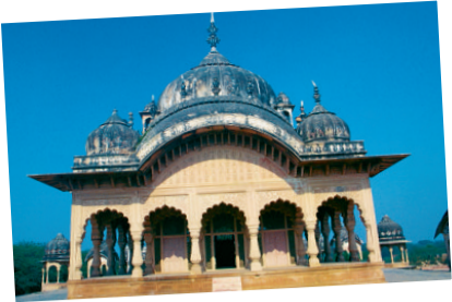
Above: Kusum Sarovara in India. Left: Orinoco the Womble. Below: Lana Turner and George Bernard Shaw