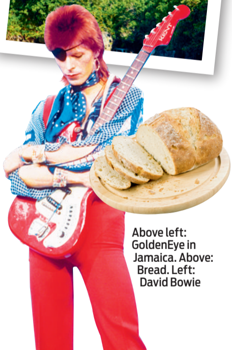
Above left: GoldenEye in Jamaica. Above: Bread. Left: David Bowie

The prized possession you value above all others... My house in Hampstead. I bought it in 1984 for £400,000 and it's worth around £5m now.