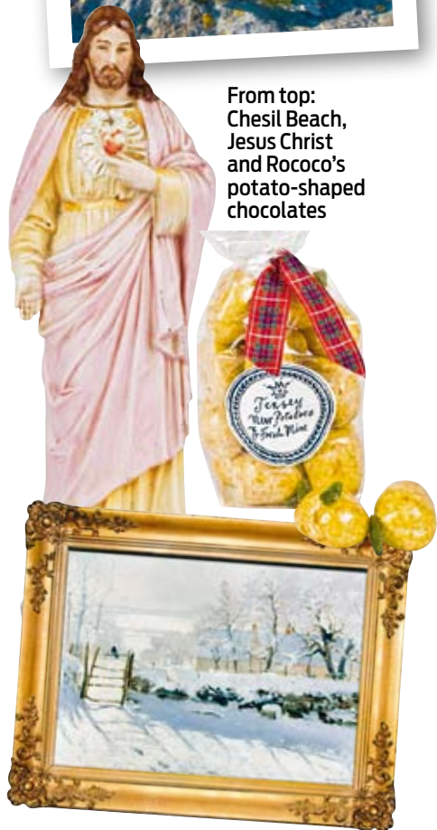
From top: Chesil Beach, Jesus Christ and Rococo's potato-shaped chocolates