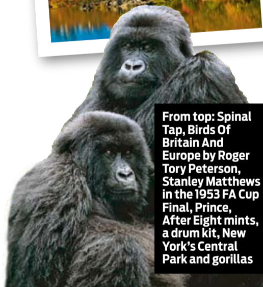
From top: Spinal Tap, Birds Of Britain And Europe by Roger Tory Peterson, Stanley Matthews in the 1953 FA Cup Final, Prince, After Eight mints, a drum kit, New York's Central Park and gorillas

The prized possession you value above all others... My Victorian house by Hampstead Heath in north London. Every room is full of memories.