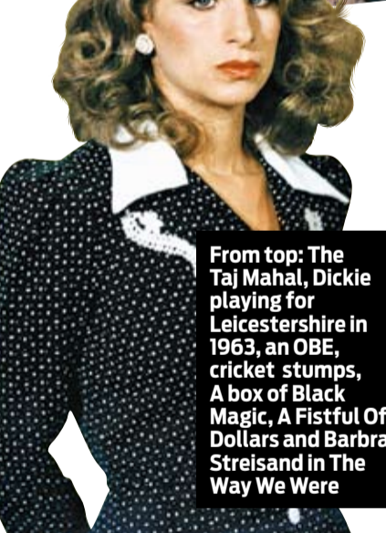
From top: The Taj Mahal, Dickie playing for Leicestershire in 1963, an OBE, cricket stumps, A box of Black Magic, A Fistful Of Dollars and Barbra Streisand in The Way We Were

The prized possession you value above all others... My MBE and OBE from the Queen. I got the OBE in 1986 and the MBE this year for services to cricket and charity. I felt very humble and proud to be British.