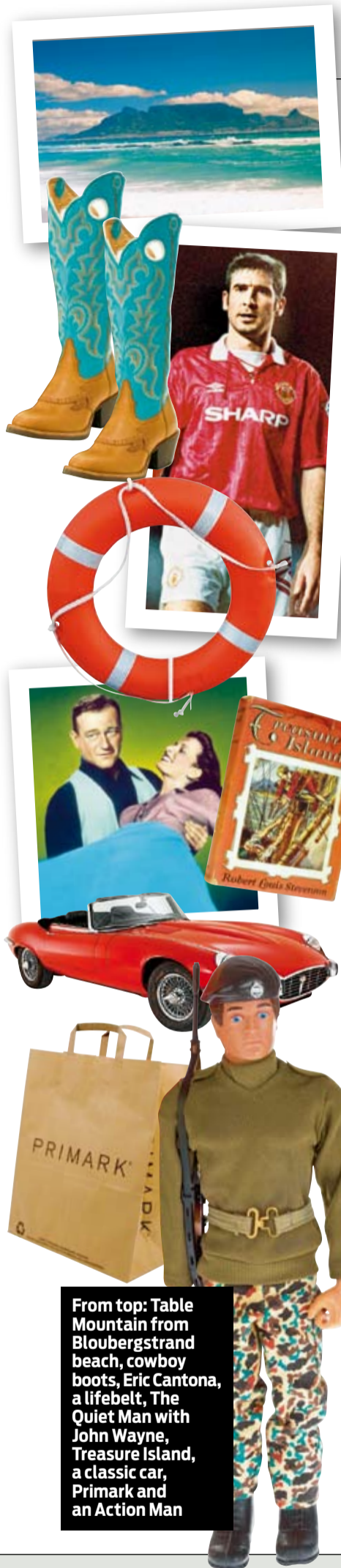
From top: Table Mountain from Bloubergstrand beach, cowboy boots, Eric Cantona, a lifebuoy, The Quiet Man with John Wayne, Treasure Island, a classic car, Primark and an Action Man

The prized possession you value above all others... A No 7 Manchester United shirt worn by Eric Cantona. I bought it at auction for £1,500 – you could still smell his aftershave on it! Years later I met him and he signed it. He's a big hero of mine.