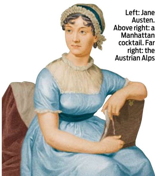
Left: Jane Austen. Above right: a Manhattan cocktail. Far right: the Austrian Alps